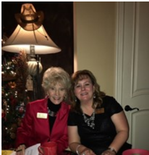
Photos from the Village Republican Women Christmas Party with Congressman John Culberson.