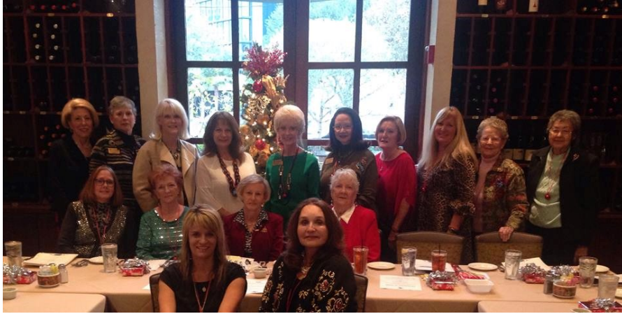
Greater Houston Council of Federated Republican Women's December Board of Directors' Meeting and End of Year Lunch- eon