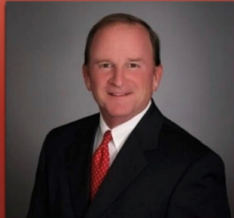
Houston Mayor Pro Tem