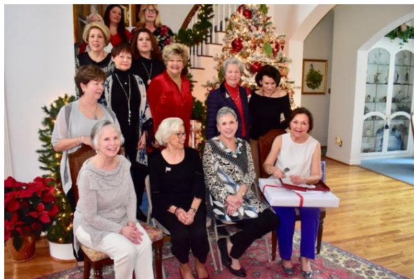
Montgomery County Republican Women at their Board of Directors Christmas Party

Cost: $30 cash or may pay online with a credit card (service charge applies) at www.villagerepublicanwomen.org beginning early February