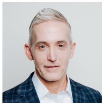
HON. TREY GOWDY

Former Member of the U.S. House of Representatives (2011-2019)