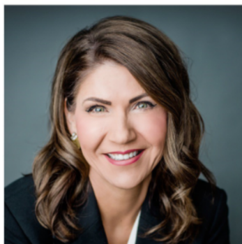
HON. KRISTI NOEM