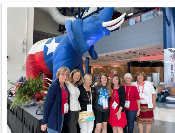
RW of Katy