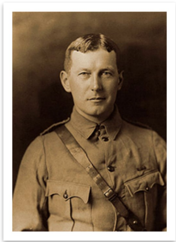
Lieutenant-Colonel John McCrae