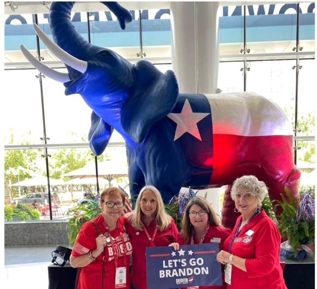
Needville Republican Women