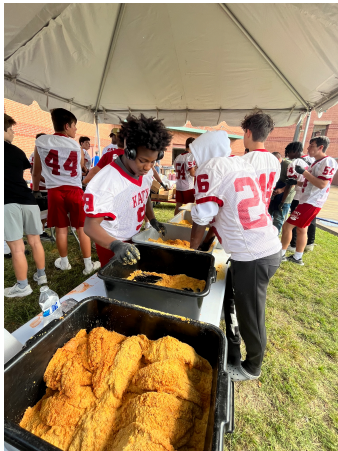
Katy Police Association Fish Fry